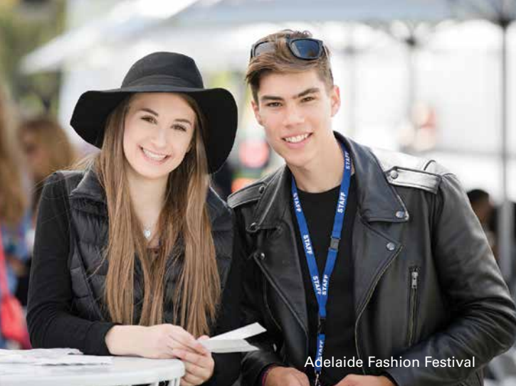
Adelaide Fashion Festival