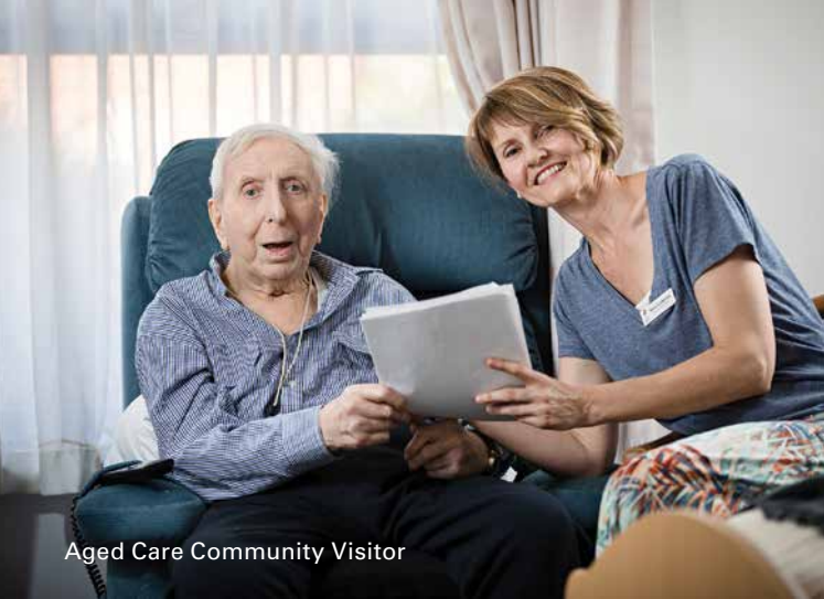
Aged Care Community Visitor