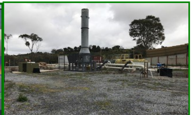
The LoCal flare installed and operating at the Highbury landfill