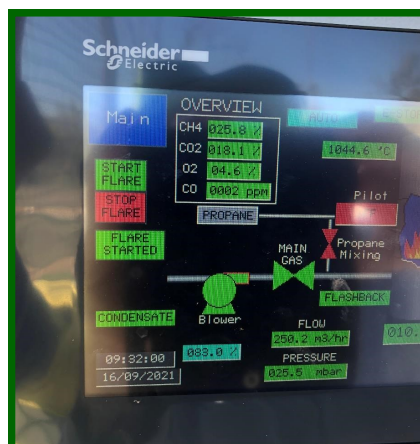
Control panel of flare operating