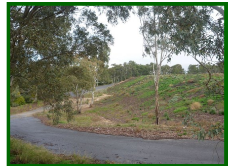
Torrens Road Entrance

The accounting standards require Highbury to estimate the future costs over an initial period of at least 25 years to meet the legislative requirements of a closed landfill in South Australia. HLA is now 11 years into the post closure management period and the provision in the accounts is a net present value (NPV) calculation of the future cash outflows to manage the remaining 14 years.